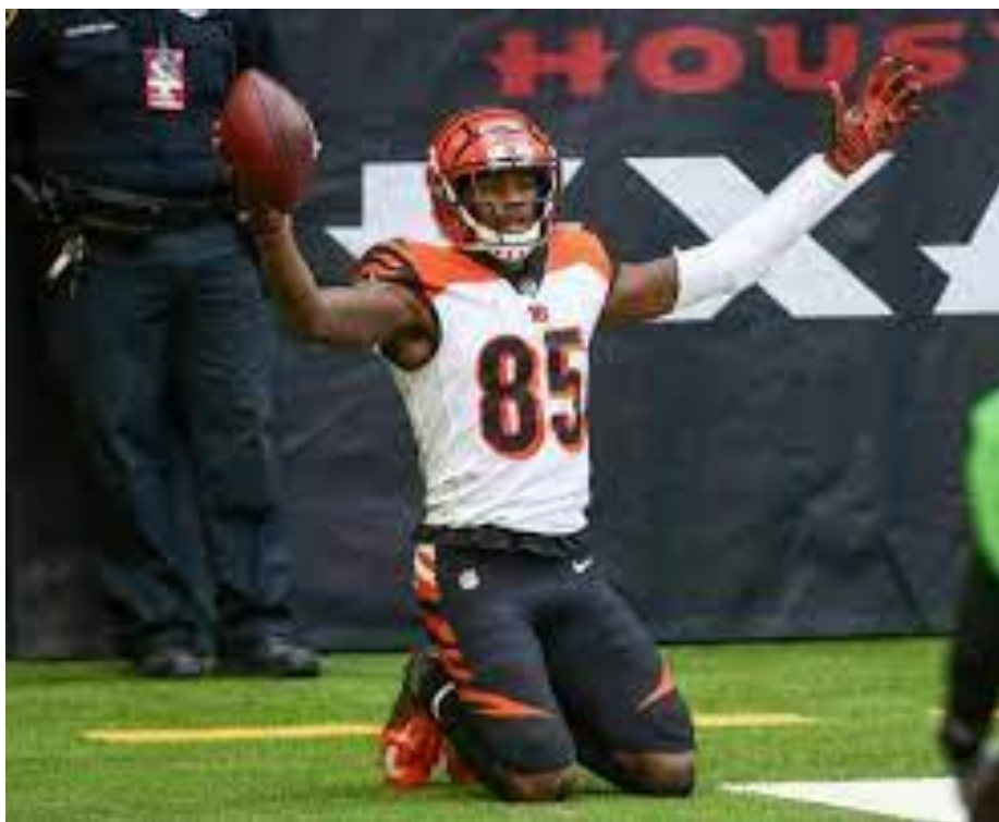
Tee Higgins making catches as a wide receiver for the Cincinnati Bengals

(As published in The Oak Ridger's Historically Speaking column the week of September 26, 2022)